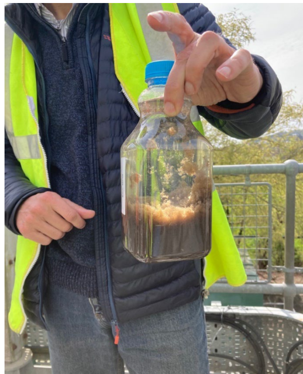
Sludge at the bottom, supernatant on top

The sludge is taken away twice a week to Poole or Yeovil in tankers to be 'digested' and turned into fertiliser. Methane – a useful biofuel – is generated during the process. The supernatant is piped out to sea. Although the supernatant has been treated by standard sewage treatment processes, bacterially it's far from sterile. That can only be achieved by using membranes, chemicals or UV radiation to treat it further and currently that very expensive treatment isn't available at Charmouth. (It's normally only used for water that's then returned very close to designated bathing waters –