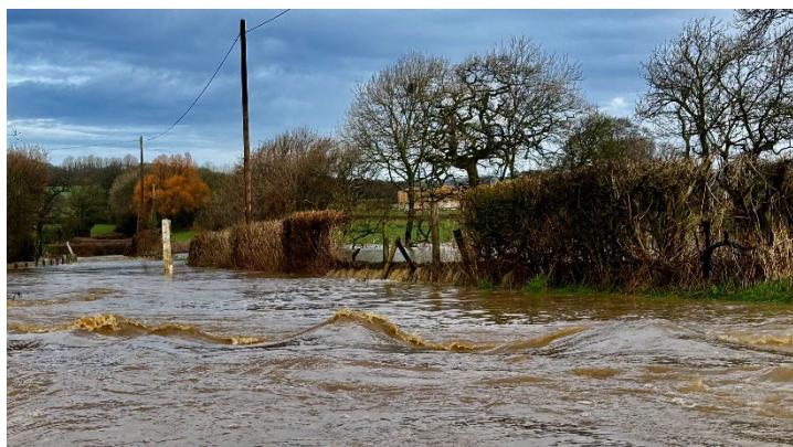
Flooding at Gasson's Lane, February 2025.