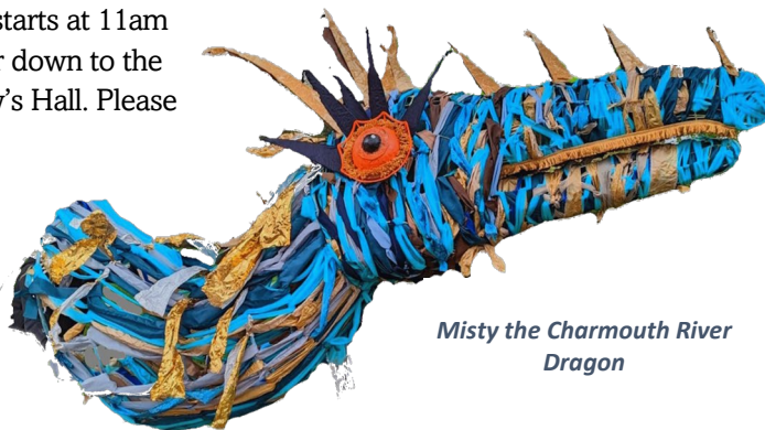
Misty the Charmouth River Dragon